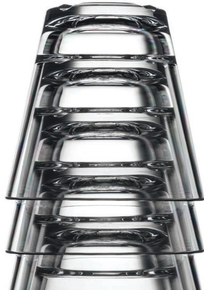
CALIBER ROCKS 9.5 oz.

The CALIBER Collection is the newest addition to our distinguished drinkware family. Don't let its sleek, contemporary appearance distract you from its true nature. These glasses are designed for easy storage in tight spaces and will dry when stacked wet. And, of course, they're engineered with the same toughness found in all Drinique Drinkware.