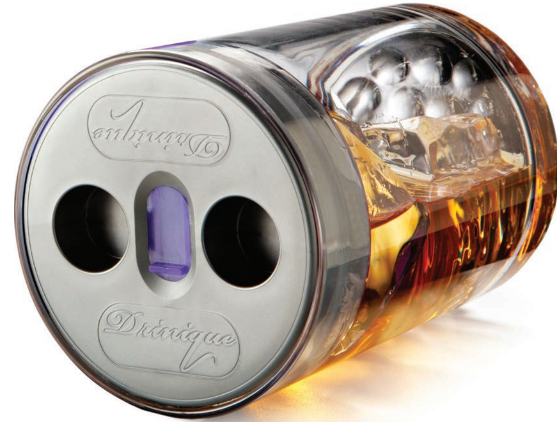
CLASSIC PINT 16 oz.

The CLASSIC Collection of drinkware has all the features of the Elite Collection with the addition of Drinique's patented lid system. Just twist in a colorful lid (it also doubles as a coaster), and spills are instantly prevented. Plus, drinks stay colder longer – perfect for pools, patios, boats, RV's and more. Kids love them too!