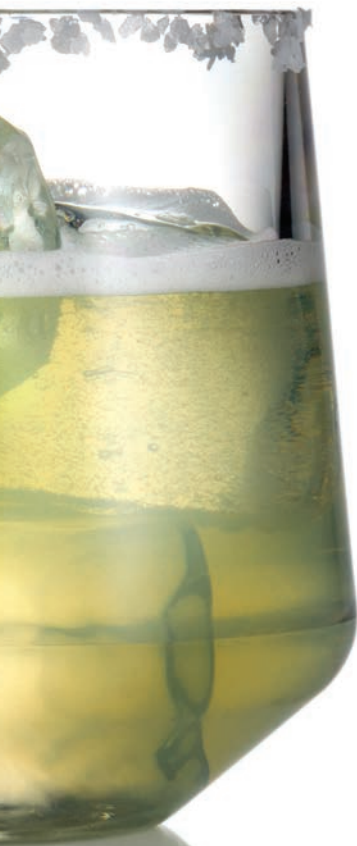
STEMLESS GLASS 12 oz.

STEMLESS, BUT NOT SHORT ON PERSONALITY OR FLAVOR.